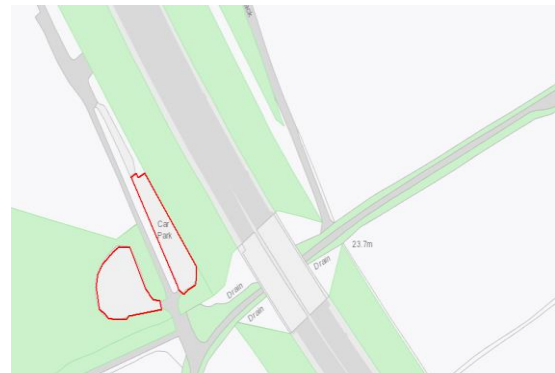
Map above showing dogs on lead area within Lower Haysden Lane Car Park