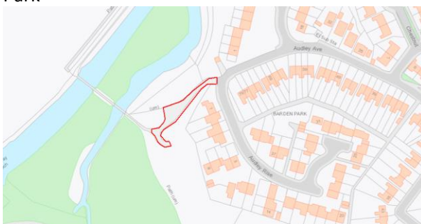
Map above showing dogs on lead area within Audley Rise Car Park