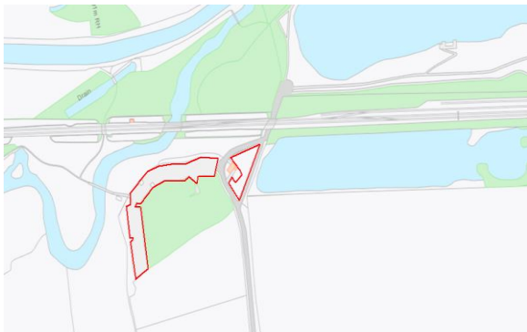
Map above showing dogs on lead area within main car park and catering area within Haysden Country Park

No person may camp in any place within the Country Park unless specifically authorised in writing by the Council.